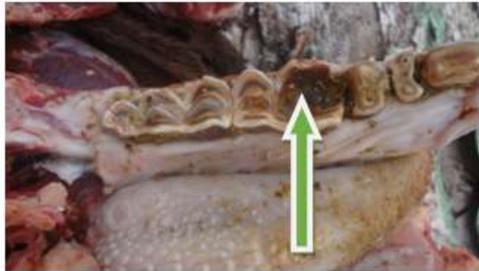
Figure 1. Lower dental of an adult camel row showing attrition