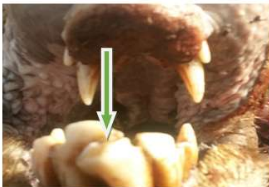
Figure 5. Lower dental row of adult Camel showing transposition of the crown (incomplete transposition)