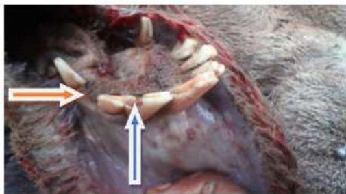
Figure 3. Lower dental row of adult camel showing missing tooth (red arrow) and broken tooth (blue arrow)