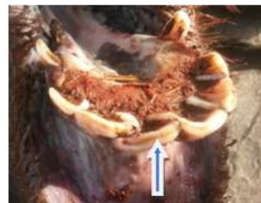
Fig. 4. Lower dental row of adult Camel showing Enamel hypoplasia