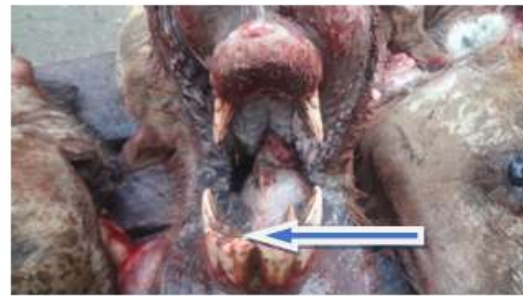
Figure 2. Lower dental row of adult Camel showing a mineralised plaque adhered to the tooth surface (dental calculi)