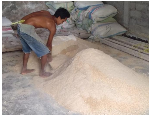
Figure 2. Manual Stirring of Animal Feed Mixture

physiological work posture. Work posture that are not physiological can be caused by the characteristics of task demands, work tools, work stations, and work Posture that are incompatible with the abilities and limitations of the workers [4]. Non-physiological work posture that is carried out for years can cause bone deformities in workers [9]. Kimberly [12] stated that there needs to be a change in the work system to reduce the level of worker fatigue. Roles, et al., [13] made a study on a work model based on ergonomic principles, and found that the work model was able to reduce fatigue by 17.71% [13]. Torik, et al, [14] also stated that designing an ergonomic work system can reduce the level of worker fatigue. The working posture and working conditions of the craftsmen are as shown in Figure 2.